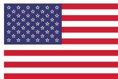
Donald Trump President of USA